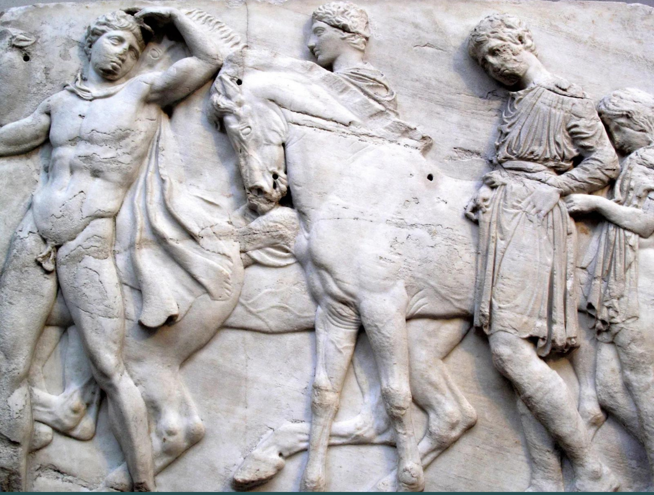
Two horsemen about to mount and join the processions